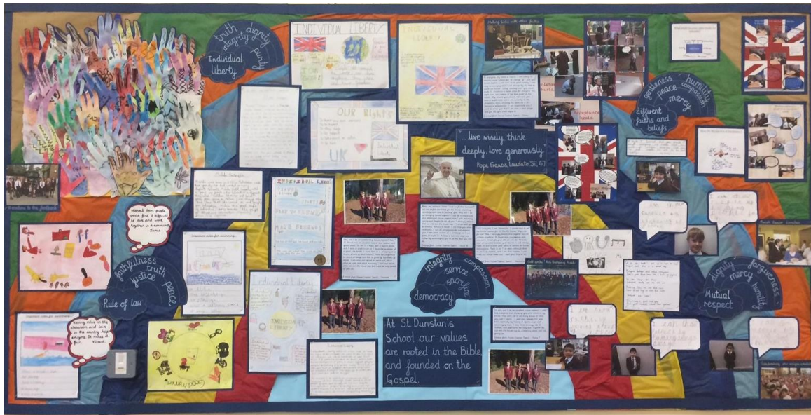
British and Gospel Values Display

At St Dunstan's these values are at the heart of all we do and are encompassed in our Mission Statement and deep core values.